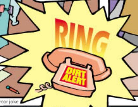
*election year joke

OKAY, TEAM! WE'VE GOT A CULMINATING CURBSIDE CRISIS AT 432 OFFAL STREET! LET'S GO!